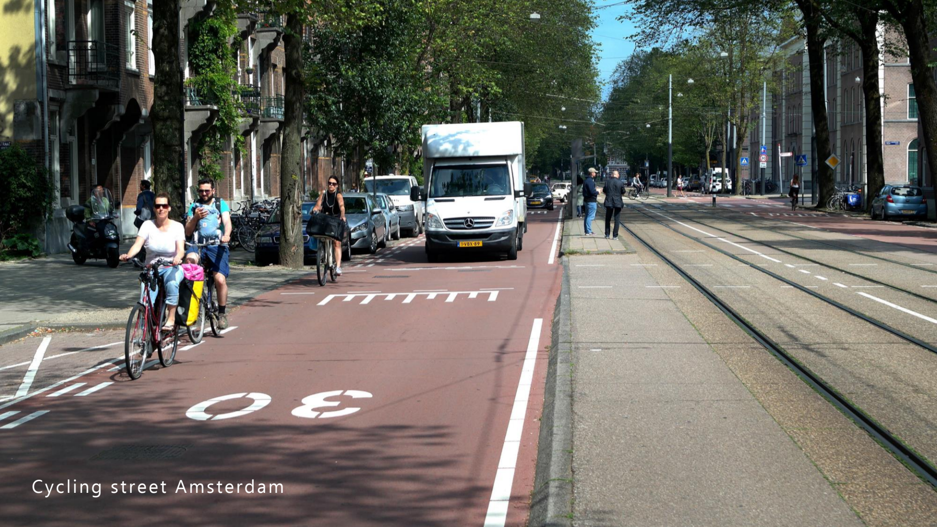
Cycling street Amsterdam