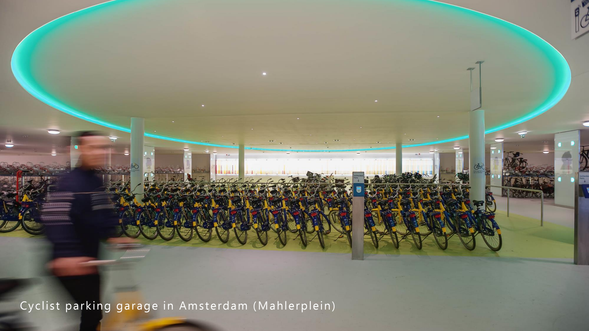
Cyclist parking garage in Amsterdam (Mahlerplein)